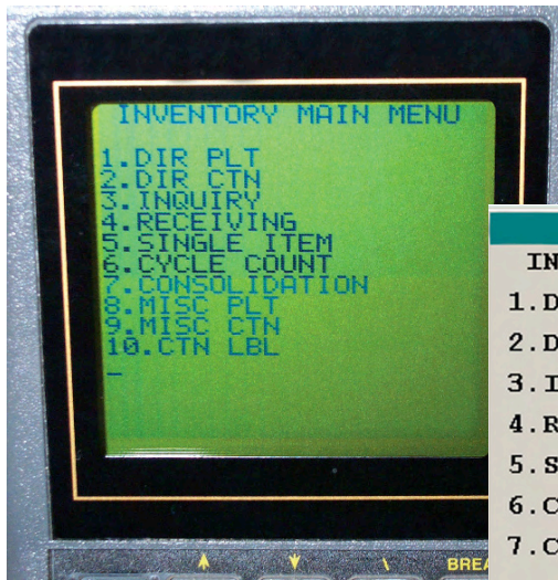
Old DOS screen

* VIA "C" Port services require the original C source code with no third party libraries.