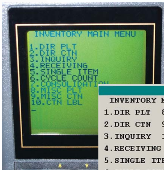
Old DOS screen ▲

With Quest Solution you will get what you want, what you spec, what you order and what you need. We guarantee it.